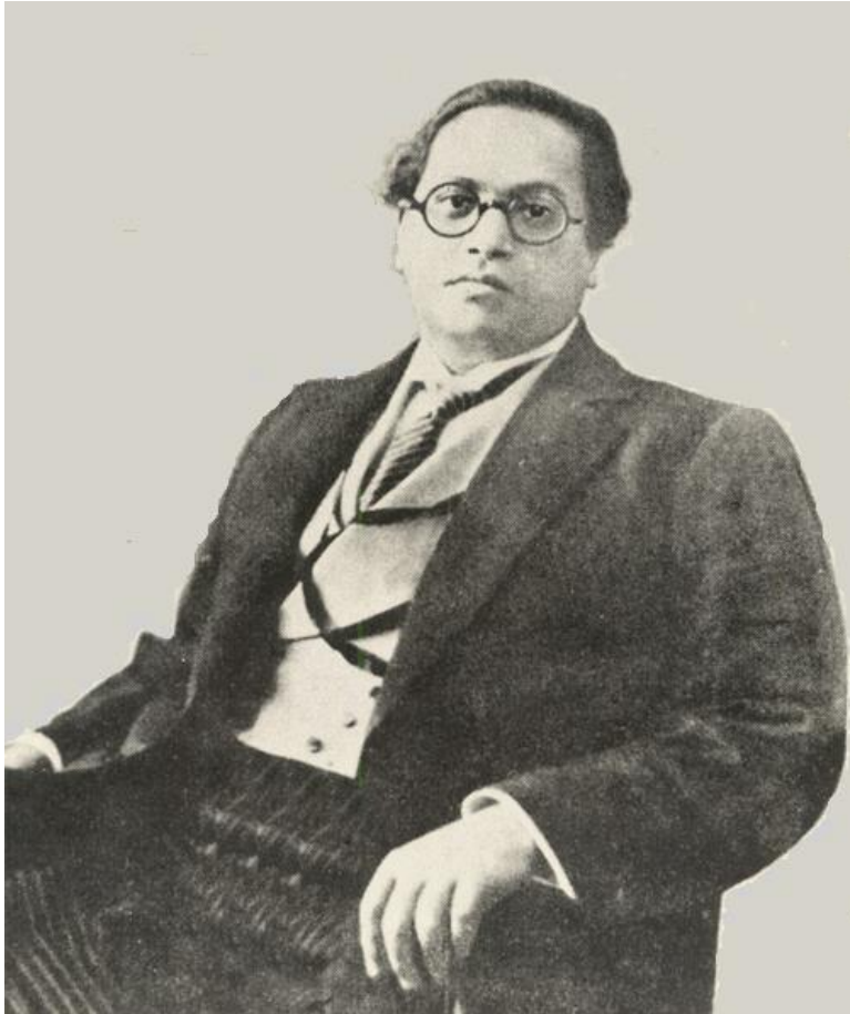
A rare photo of Dr. Ambedkar from his years as a grad student at Columbia, 1913-16.