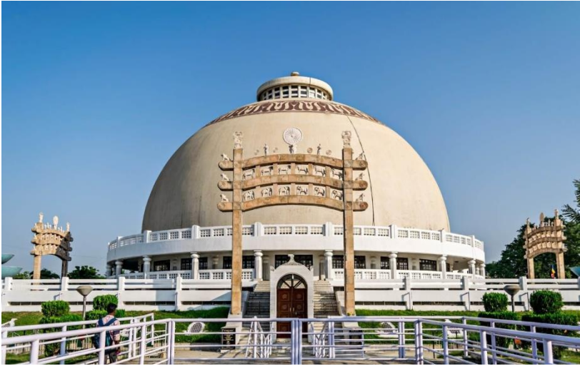
"Diksha-bhumi" in Nagpur, Maharashtra, India The Sanchi-like site of Dr. Ambedkar's conversion ceremony.